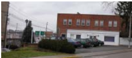
Site of Downtown Campus Gateway

Preparations for the gateway are in the early planning stage.