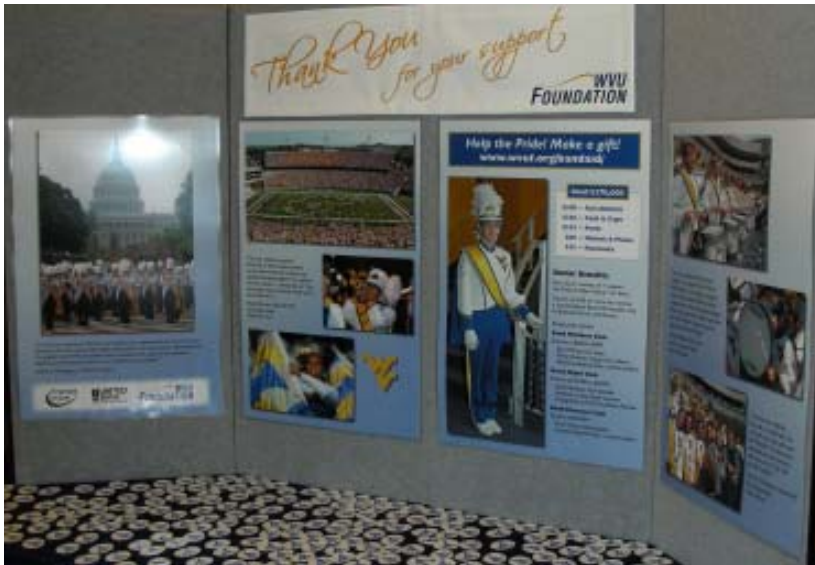
Band Aid "Thank You" Display at WVU's Gator Bowl Fan Center