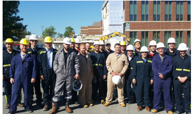
Energy land management students gather outside Percival Hall prior to a field trip.