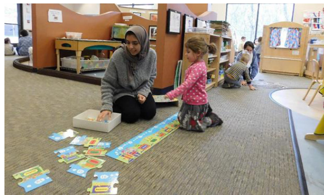
Students receive hands on training at the WVU Nursery School.