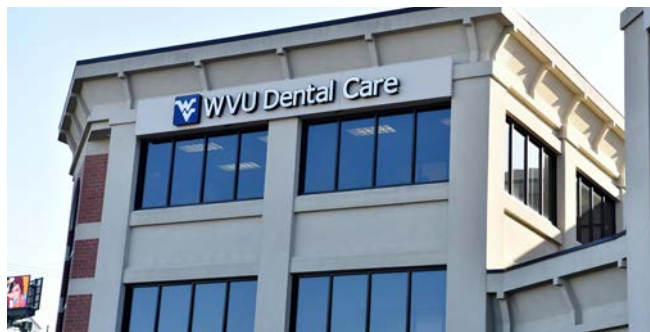
WVU Dental Care office in Morgantown

approximately 85 percent of whom are WVU School of Dentistry alumni.