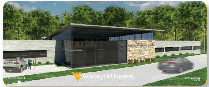
A rendering of the north entrance to the new basketball practice facility.