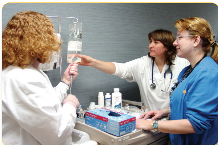
WVU nursing students will benefit from a gift from the Helene Fuld Health Trust.