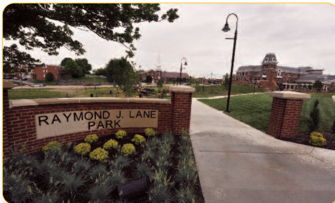
One of the entrances leading to the park.

Davis College of Agriculture, Natural Resources and Design