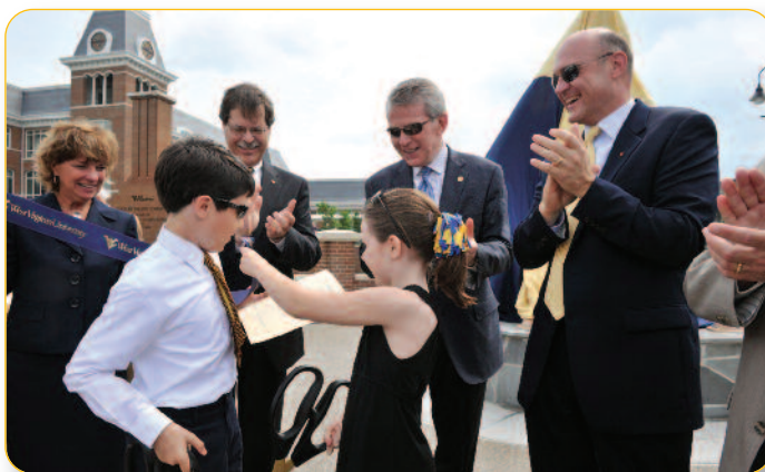
Members of the Lane family cut a ceremonial ribbon during dedication of the park.

The dedication also featured the unveiling of "From the Mountain," a 14-foot tall bronze statue created by WVU alumnus Burl Jones.