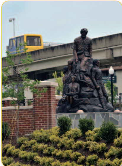
The park features a 14-foot tall bronze statue called "From the Mountain".

The beautiful seven-acre green space adjacent to The Erickson Alumni Center features lighted walking paths, a pedestrian bridge, benches and grass lawns. Additionally, the park is beautifully landscaped with native vegetation, including more