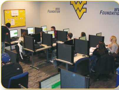
The newly remodeled Mountaineer Line call center

A dditional call stations, improved software and a fresh new look are all part of recent upgrades made to the WVU Foundation's Mountaineer Line student call center.