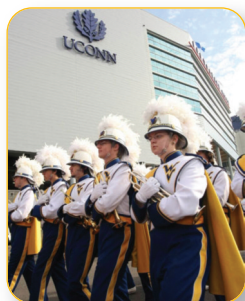
The 'Pride' marches in front of Rentschler Field at the University of Connecticut.

T he 2008 Pride Travel Fund received $89,150 from 782 donors, helping defray travel costs for the WVU Marching Band, known as the "Pride of West Virginia."