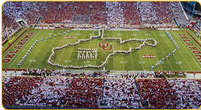
The WVU Marching Band performs at Oklahoma Memorial Stadium during halftime of the WVU-Oklahoma football game.

Fans of the WVU Marching Band once again went above and beyond in support of the Pride of West Virginia in 2013. The Foundation's Pride Travel Fund received a record $103,232 from 941 donors, breaking the 2012 record of $103,083 from 892 donors.